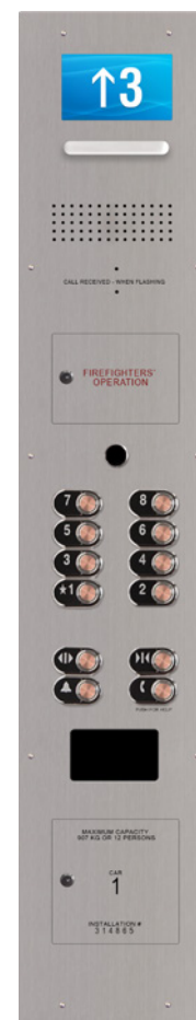
SS#4 COP shown with 7" Giotto PI, BS Copper pushbutton, Julius Surround non-illuminated tactile.