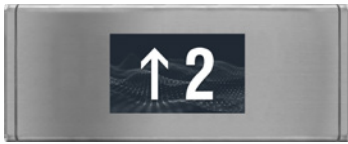
Hall Position Indicators with and without arrows. Standard and custom graphics shown.