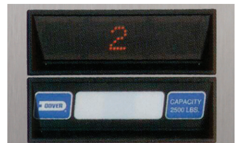
Before Impulse+ retrofit