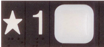
Impulse Fixture pushbutton