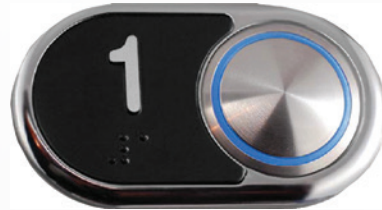
BS Classic Series pushbutton with Julius surround