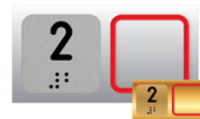
SS Braille Tag (Non-illuminated) - 2.9x1.6"