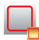
No Braille Tag 1.6x1.6"