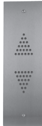
Vandal Eccentric Lens